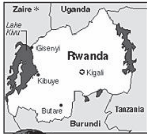
Map of Rwanda