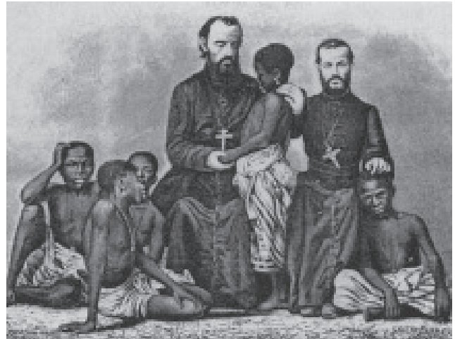
Missionaries in Rwanda.

In 1916, the Belgians won Rwanda from the Germans. They continued the same system of indirect rule originated by their German predecessors. They favored the Tutsi socially and economically. They selected mostly Tutsi for government jobs. Places in schools were open only to Tutsi. Even the Catholic Church selected only Tutsi for the priesthood. However, these positions were few and far between and most Tutsi, like the majority of Hutu, remained poor peasants.