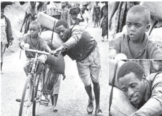
Workable Peace: Rwanda Role Play Copyright © 1999 by the Consensus Building Institute. All rights reserved.