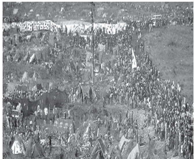
Refugees at Camp Goma, Zaire.

On 14 July 1994 the RPF declared victory in the war, which had broken out again when the genocide began. However, the massacres were already winding down. Two million out of Rwanda's seven million people, mostly Hutu, fled the country as refugees. Conditions in the refugee camps were hellish. The refugees were tightly controlled by the same local officials that had incited them to kill their neighbors. Some refugees had participated in the slaughter of the Tutsi, but in the refugee camp it was impossible to sort the innocent out from the guilty. On July 21, deadly cholera broke out in one camp called Goma. After two weeks, 50,000 people (5% of the camp's population) had died from the disease. Only in 1996, forced by instability within their host countries, did the Hutu local officials in the camps allow the refugees to return home.