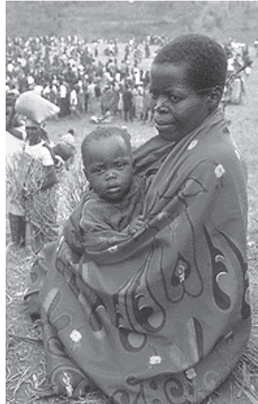
Tutsi woman and child at Camp Goma, Zaire.

The people of Gisenyi returned to find that their village had changed, and that some of their lands had been claimed by others. All of the people in this negotiation knew each other before the genocide, except for the new prefect (governor) of the region, who had been sent by the new government in Kigali.